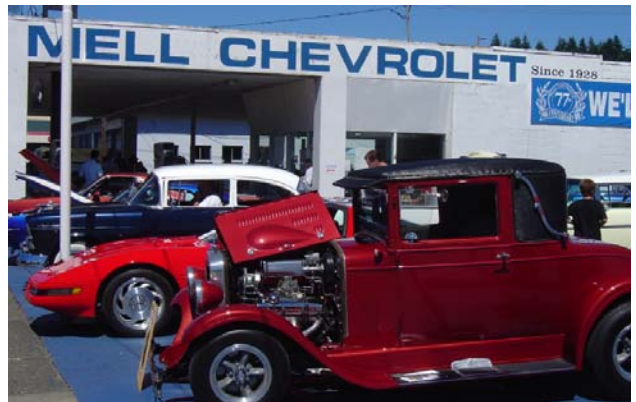
Jim Franklin's 55 Chevy 2nd car in Jim Patterson's 37 Chevy 5 th car in the row