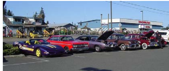
Some of the Rakers