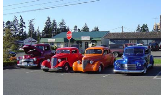
More of the Rakers