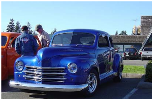
Gary Schryver's '47 Plymouth Coupe