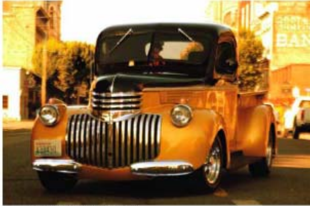
Jim Arrabito's 1941 Chevy Pickup

www.chevytrucksand.com (320)16 (jm arrabito)