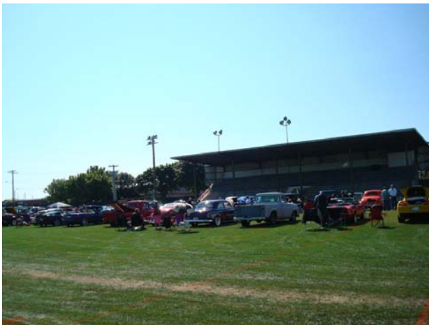
Rakers 2009 Car Show